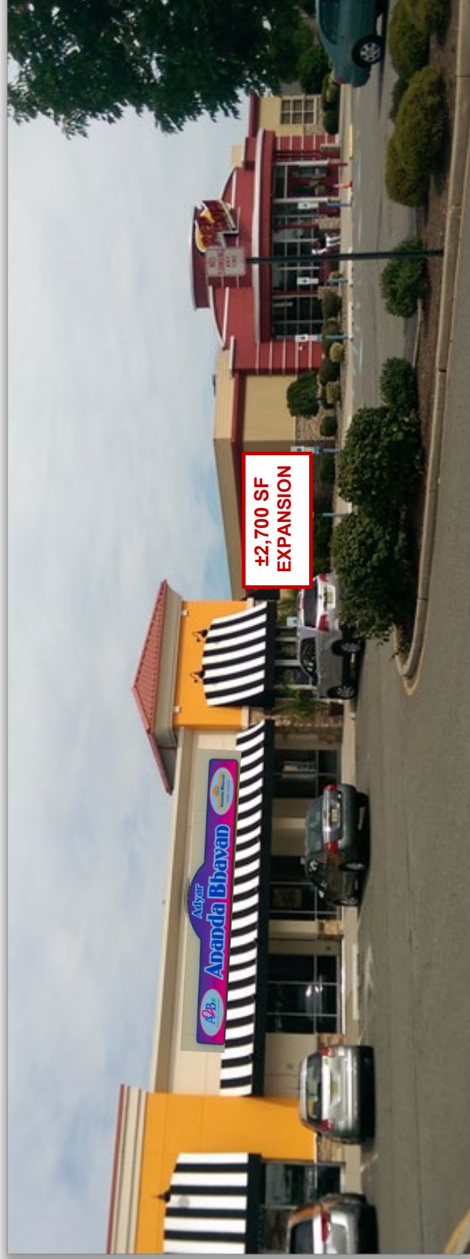
South Plainfield Plaza – Exterior Photo