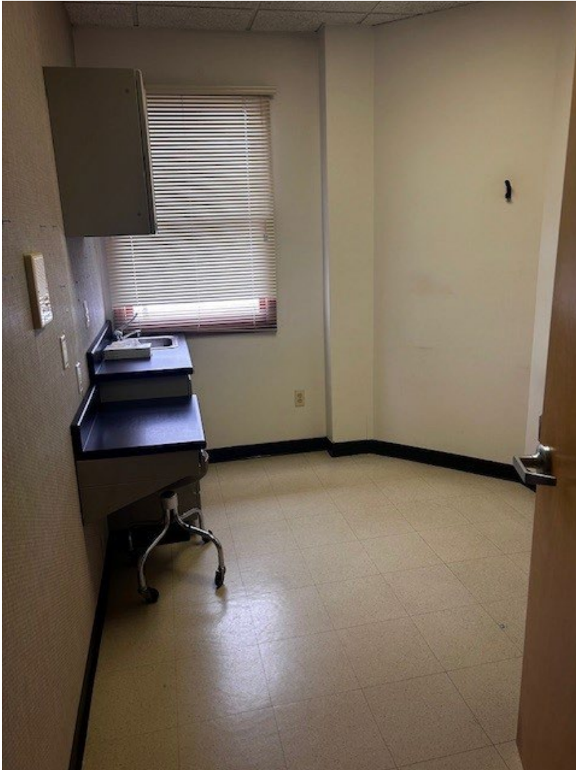
Exam Room 1