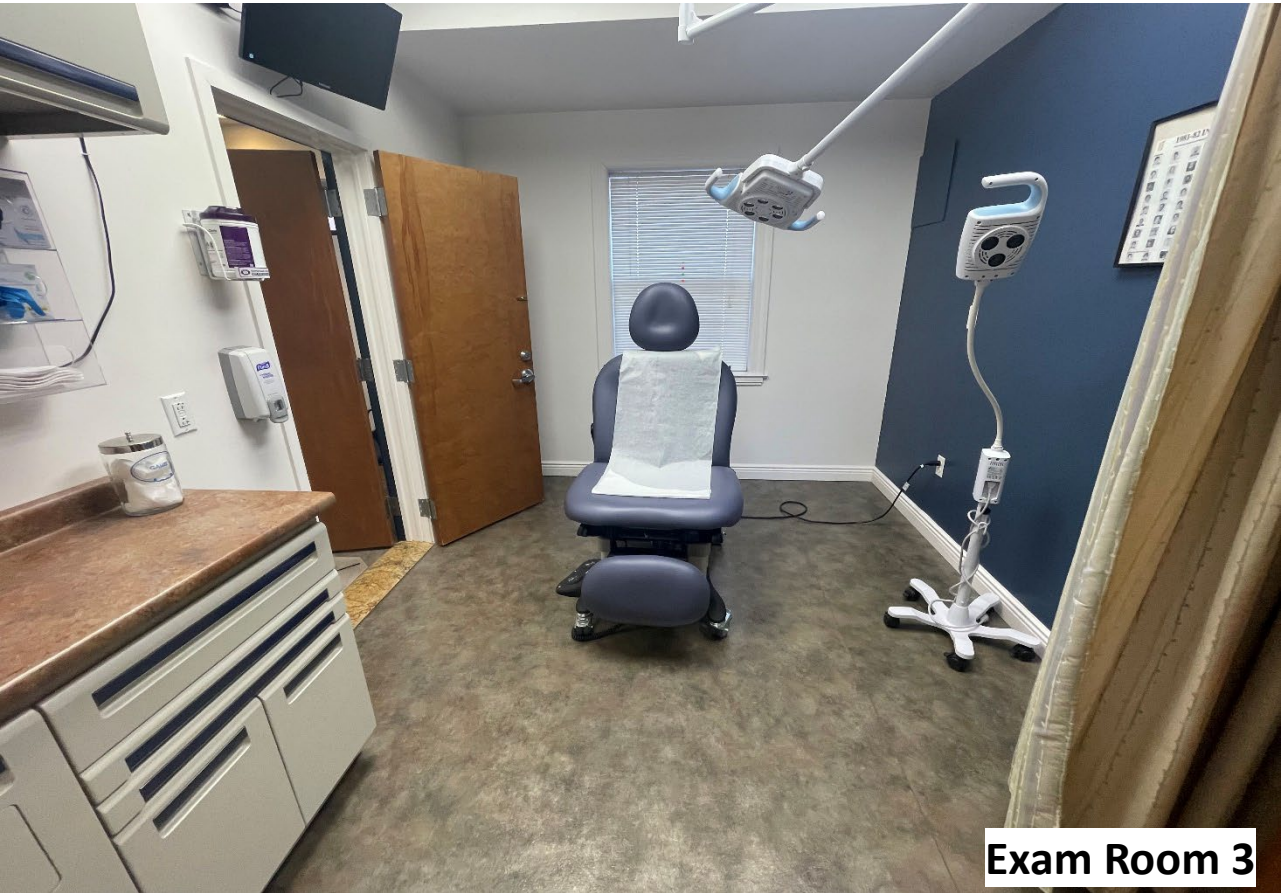
Exam Room 3