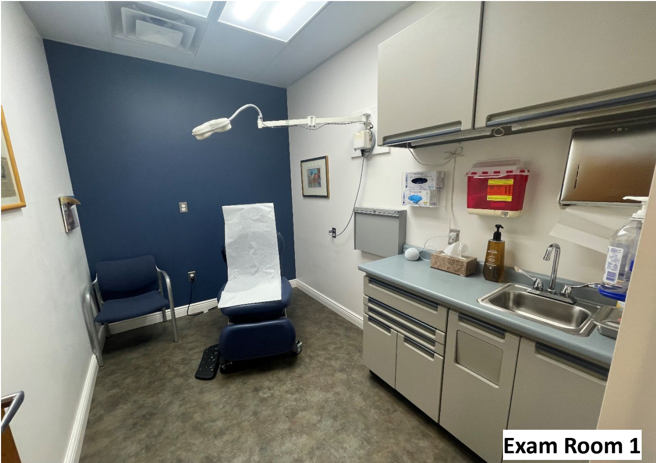
Exam Room 1