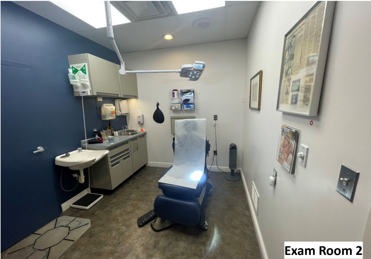
Exam Room 2