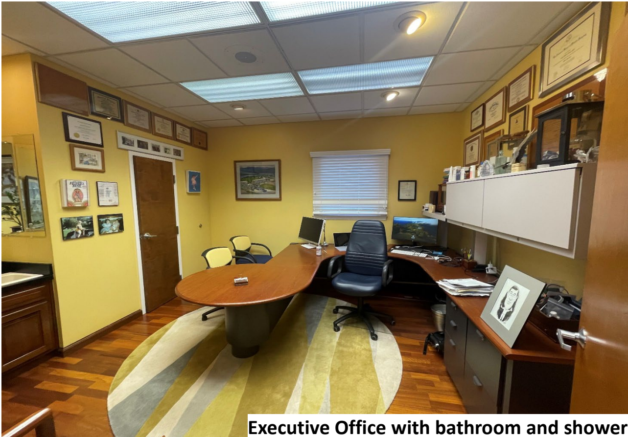
Executive Office with bathroom and shower