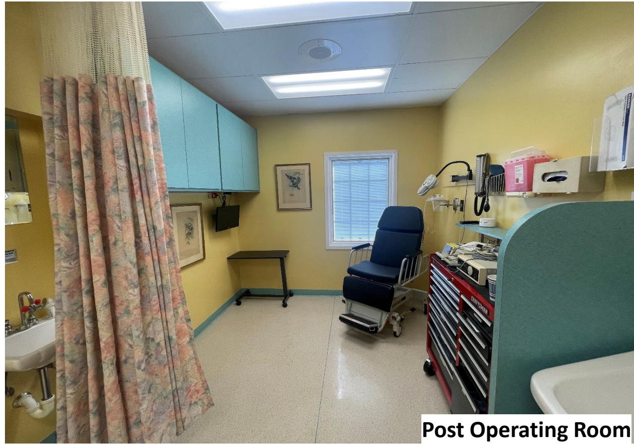
Post Operating Room