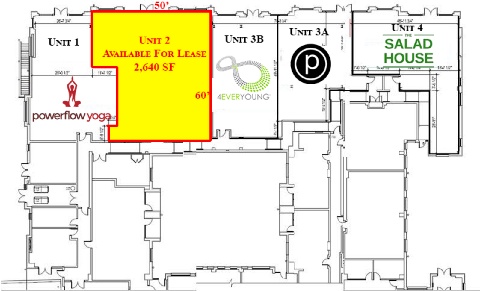
1 PARTIAL 1ST FLOOR RETAIL PLAN SCALE: 1/16" = 1'-0" R-12/20